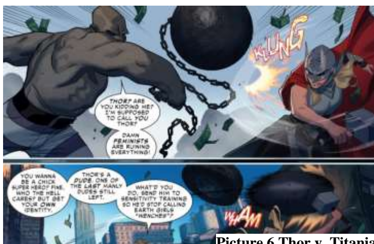
Picture 6 Thor v. Titania

this particular issue because it is so out of character, especially for Titania since she always wants to fight other female heroes to prove herself as the strongest. The authors were just trying to make the new Thor much more of a big deal than she actually is. She is not the first female superhero to hold such a prominent role in a comic universe, and definitely not the last. This was clearly Jason Aaron's way of commenting on the recent hate he was receiving for writing this comic book but also extremely patronizing. Just imagine this scenario occurring with two male characters or a male and a female character.