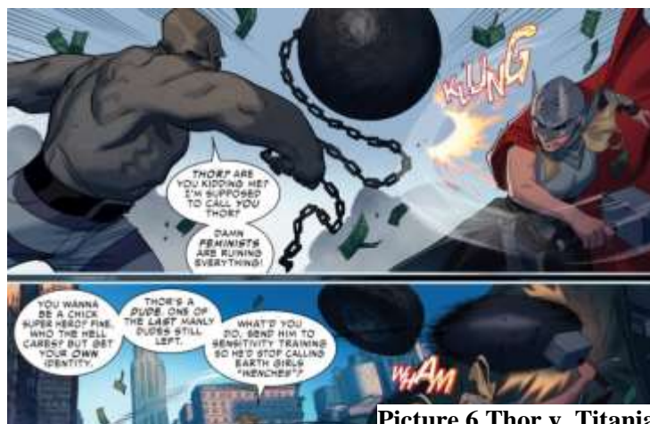
Picture 5 Thor v. TPicture 4 Thor v. Absorbing Man (Aaron, Thor, 2014)

this particular issue because it is so out of character, especially for Titania since she always wants to fight other female heroes to prove herself as the strongest. The authors were just trying to make the new Thor much more of a big deal than she actually is. She is not the first female superhero to hold such a prominent role in a comic universe, and definitely not the last. This was clearly Jason Aaron's way of commenting on the recent hate he was receiving for writing this comic book but also extremely patronizing. Just imagine this scenario occurring with two male characters or a male and a female character.