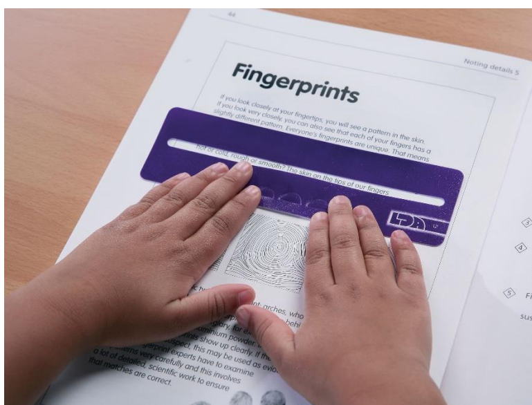
Picture 3 The usage of the "reading window" (Ajduković, et al., 2017, p. 17).