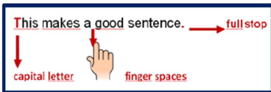
Picture 2 An example of a poster which should be present in the classroom as a reminder on how to correctly form a sentence (Ajduković, et al., 2017, p. 9).

If a teacher wants to teach the word “cat”, they want to make it clear for the student – the letters need to be bolded and in font 16 or 18, the picture should be realistic and without further details so the child can focus on what is important. Moreover, teachers should avoid giving tasks in which a child has to untangle the letters in order to find a word and it would be preferable to use the same symbols for frequent activities for example for creating correct sentences. (Picture 2)