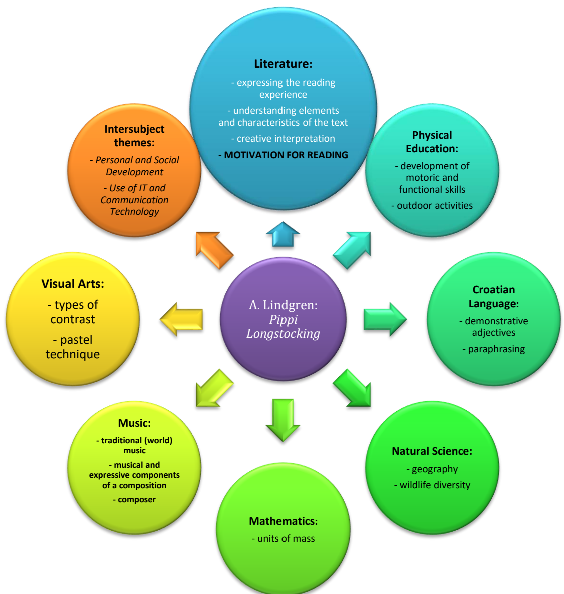
Figure 2. Thematic network

Apart from its literary aspects, this interdisciplinary plan integrates seven different subjects: Croatian Language, Natural Science, Mathematics, Physical Education, Music, Visual Arts and two inter-subject themes, Personal and Social Development