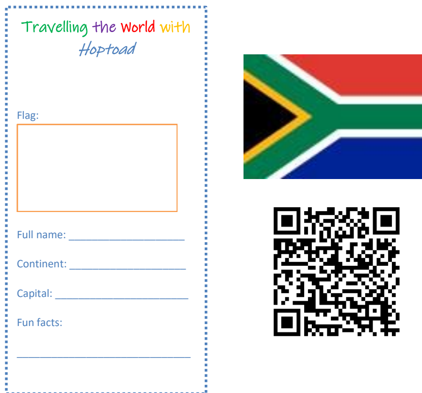
Figure 8. Exploration centre task: Travelling the World with Hoptoad 3

There are two exploration centres, where students can learn about countries that Pippi visited or animals which are mentioned in the book. In the first one, Travelling the World with Hoptoad , there are small paper flags of countries which Pippi travelled to on the table – Portugal, Egypt, Kongo, South Africa, Indonesia, India, China, Australia, and New Zealand. Each student has to choose three flags and scan the QR code on their back in order to find out certain details about the country, such as its full name, continent and capital.