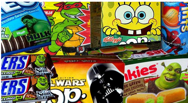
Figure 6. Cartoon characters on children's food packaging