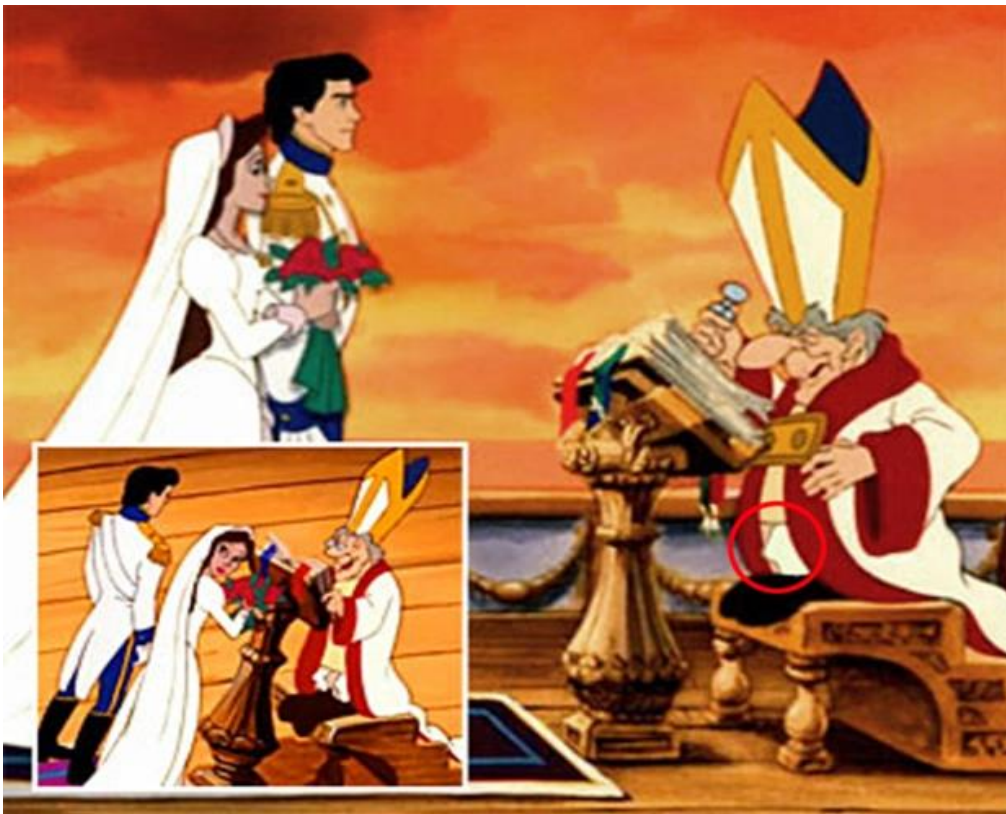
Figure 2. An example of a subliminal message in the animated movie The Little Mermaid

Note: Retrieved from https://www.thesun.co.uk/fabulous/1458136/disney-cut-erection-little-mermaid/