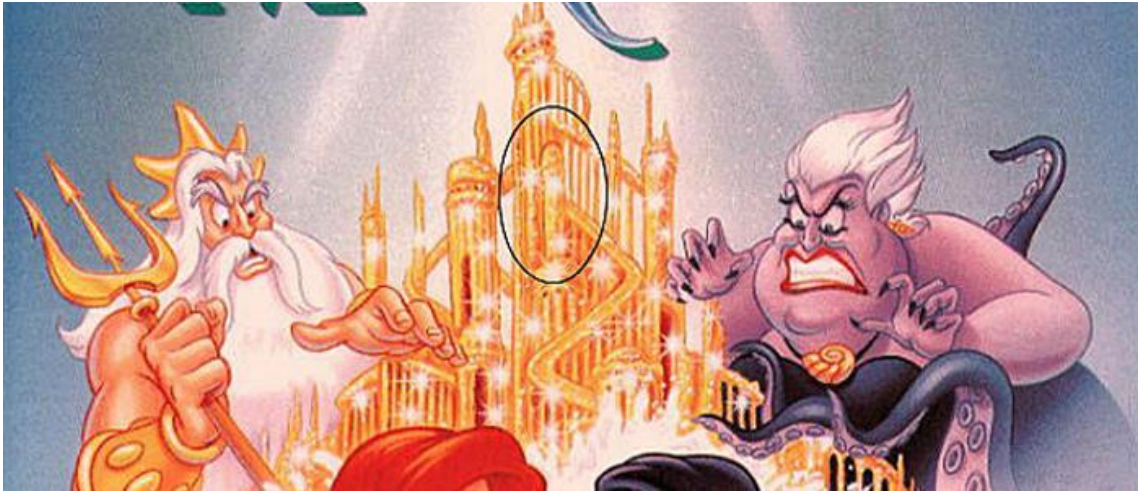
Figure 1. An example of a subliminal message on The Little Mermaid poster