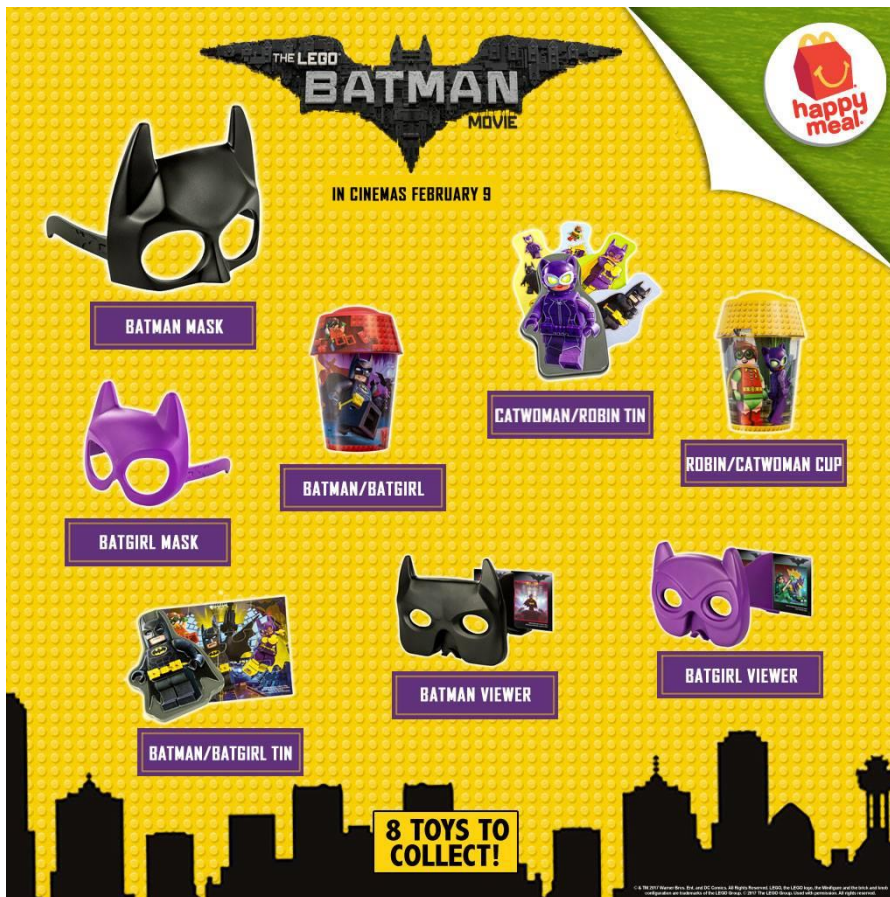
Figure 7. Lego Batman in McDonald's Happy Meal