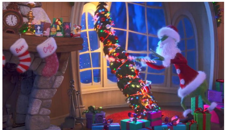
Figure 6. Movie heist