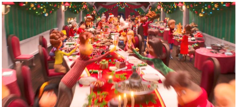
Figure 8. Movie feast