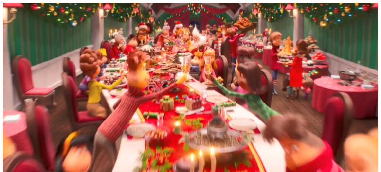
Figure 8. Movie feast