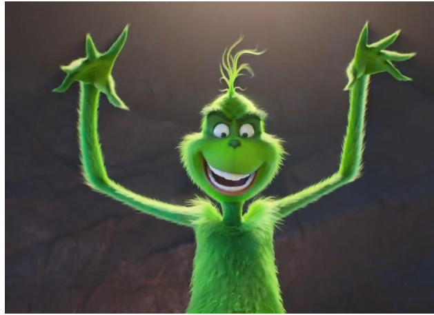
Figure 4. The Animated movie Grinch