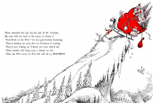
Figure 1. Picturebook sledge

The directors also decided to use Seuss’s framing of certain scenes. For example, Figure 1 shows an illustration from the picturebook in which the Grinch is seen standing on the top of the mountain, seconds away from tipping the sleigh to the ground. Figure 2 shows that same scene from the movie, which is a direct visual quotation of the image from the picturebook. Figures 3 and 4 show direct visual quotation of the Grinch’s face after he decides to steal Christmas, as well as Figures 5 and 6, which show the Grinch stealing Christmas trees. Figures 7 and 8 show the picturebook illustration and the movie version of the Christmas feast.