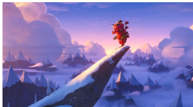
Figure 2. Animated movie sledge