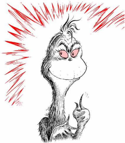
Figure 3. The Picturebook Grinch