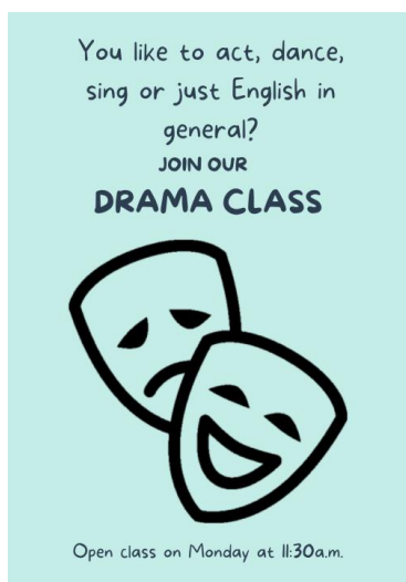
Picture 1 Drama class poster