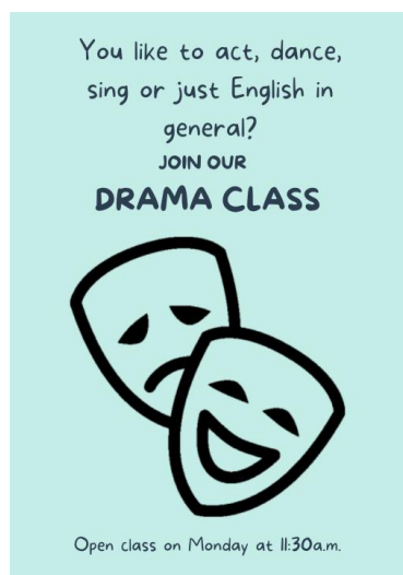
Picture 1 Drama class poster