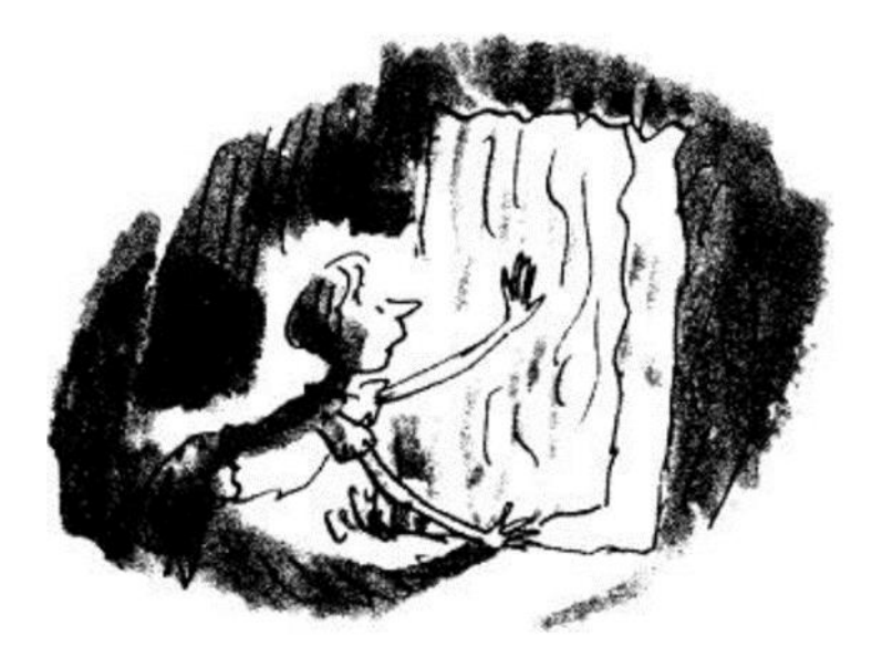
Figure 4. James Travelling Inside of the Peach