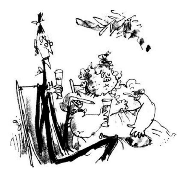
Figure 2. James Being Sad